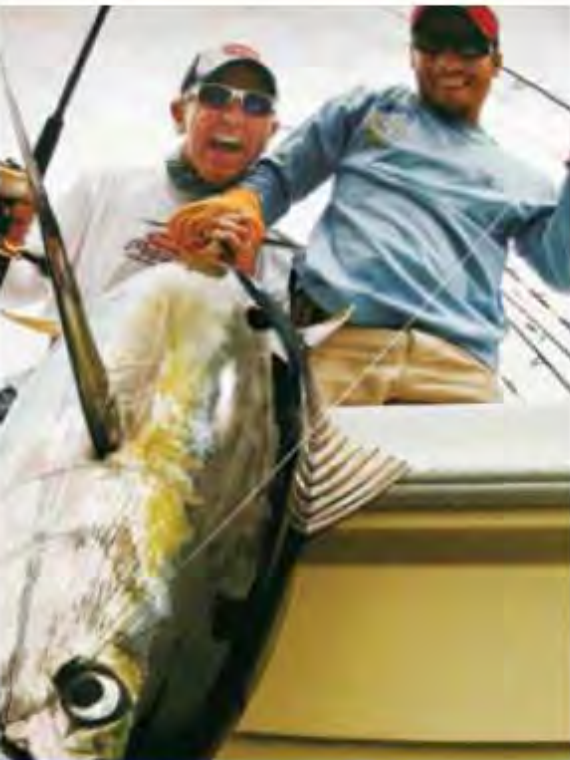
+ SPORT FISHING