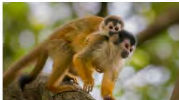
+ MONKEY TOUR