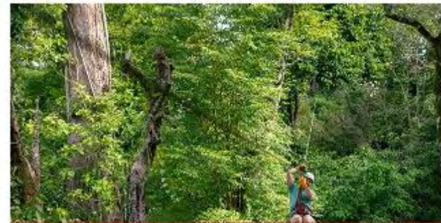
+ CANOPY ZIP LINE