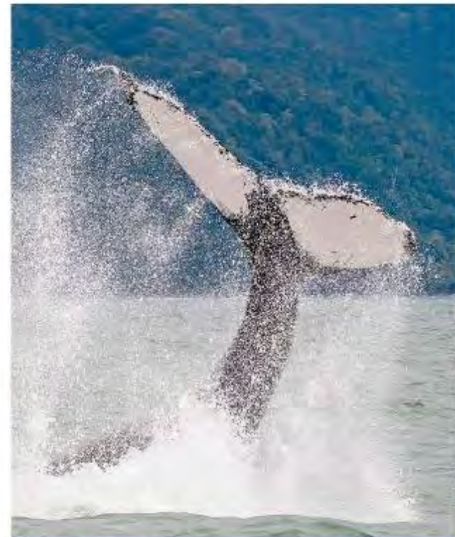
+ GOLFO DULCE EXCURSION BY BOAT