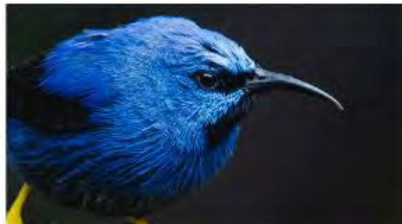
+ BIRD WATCHING